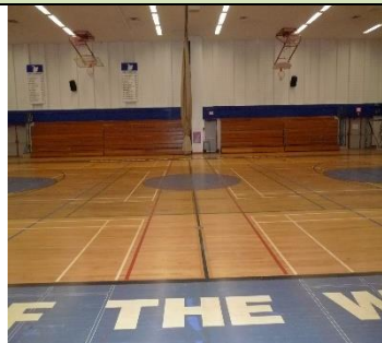
Gym from centre