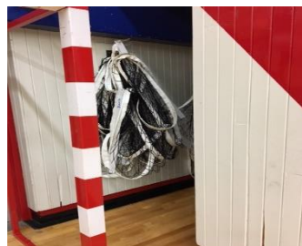
Hanging volleyball nets