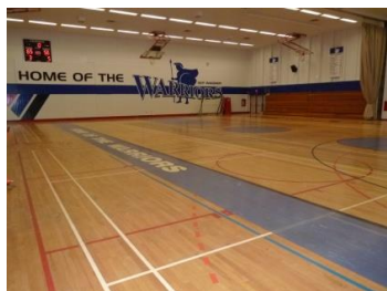
Picture of gym from Southeast