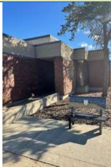
Gym entrance door