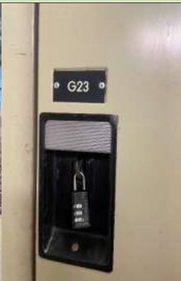
Post and net storage