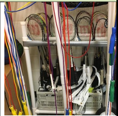
Take from corner of gym