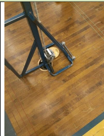
Net storage on north wall