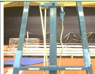
Picture of gym from South