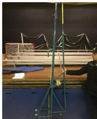
North Wall Volleyball Pole

Do not use this gym for Basketball. Has wood backboards.