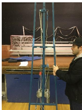
Centre Volleyball Pole