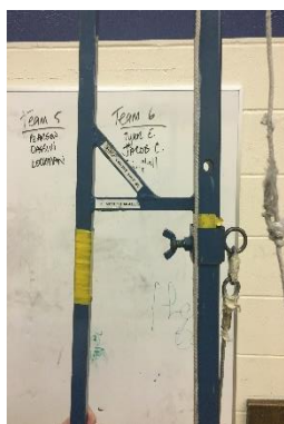
North Wall Volleyball Pole