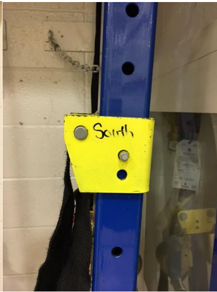
Outside (South) Volleyball post