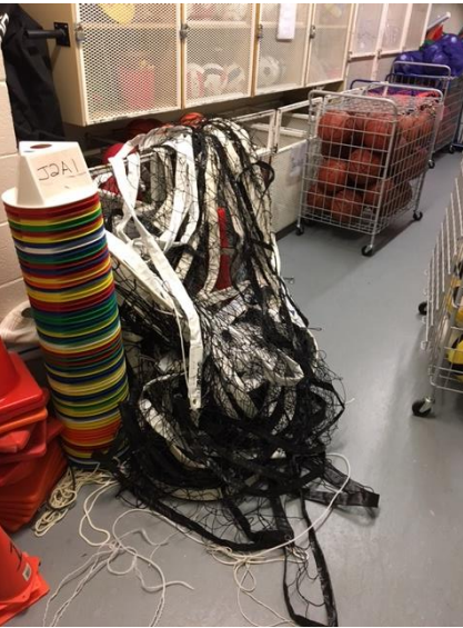
Volleyball + Badminton Nets