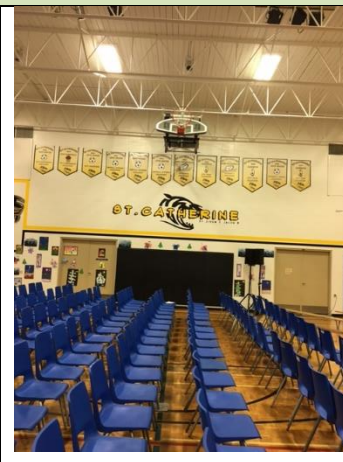
Picture of gym from Southwest corner