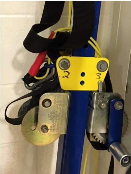
Centre Volleyball post w/ cranks