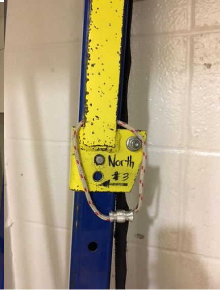
Outside (North) Volleyball post