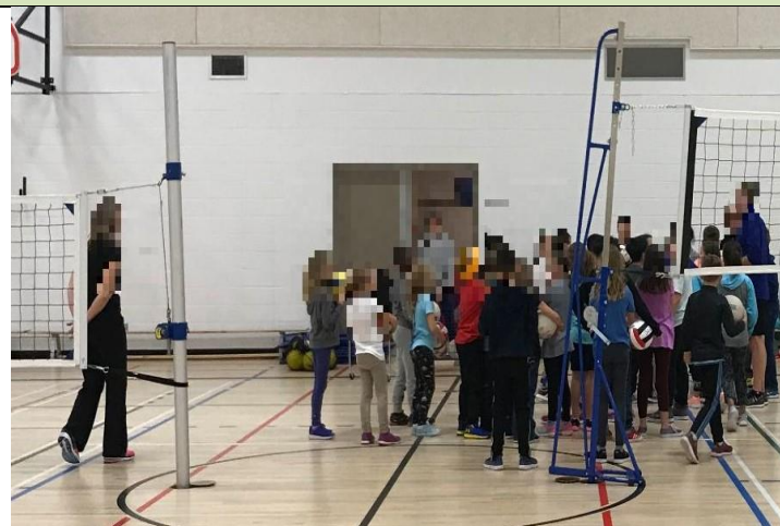
Volleyball Post Storage