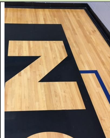
Corner view of gym