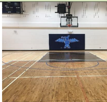
Half of basketball court