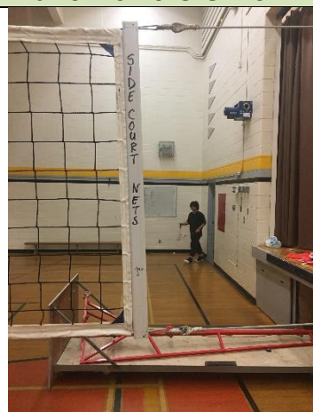
West net setup