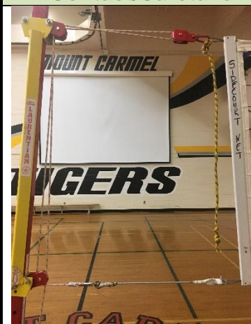
Centre post net