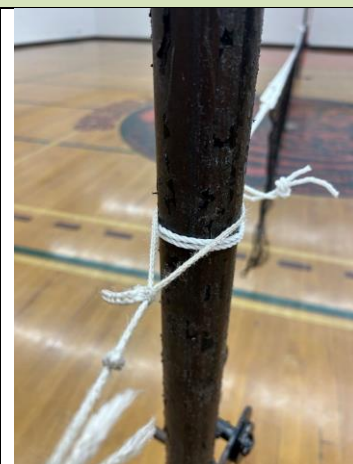
Badminton Centre Post