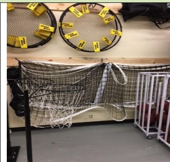
Northwest corner of gym