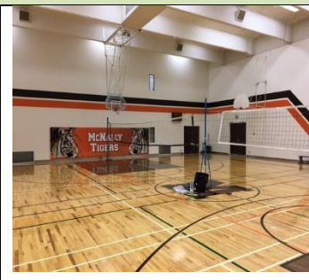
Taken from southwest corner