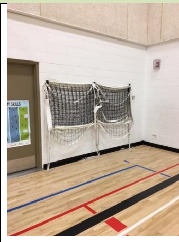
Volleyball Net Storage