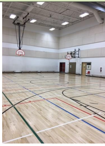
Gym from SE corner