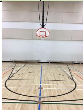
East side of gym