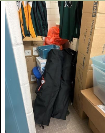
Volleyball Net Setup