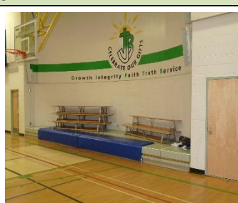
Step behind hoops