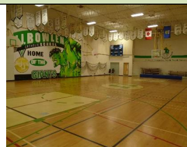
Full gym other side