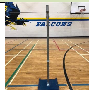
Picture of North court