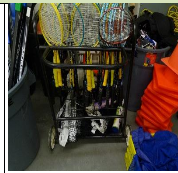
Gym from SE corner