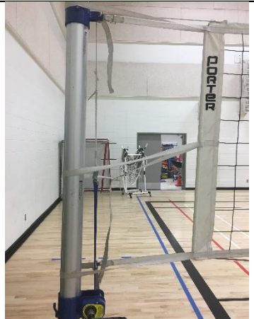
Crank side net with straps