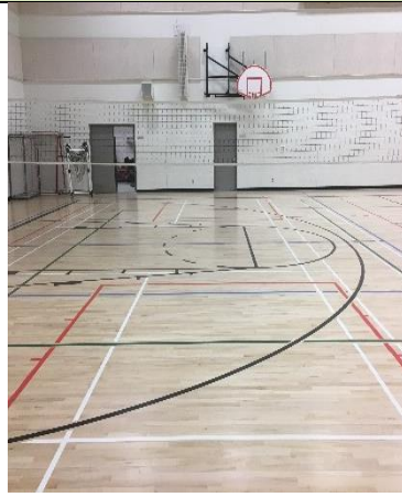
Complete Net Setup