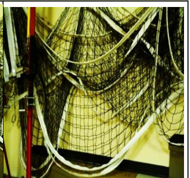
Nets hanging correctly