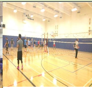
Taken from East Wall