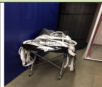
Taken from Southwest corner