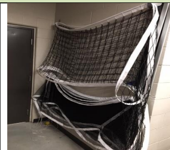
Taken from Southwest corner