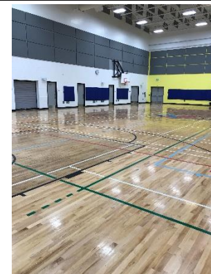
Equipment room #1