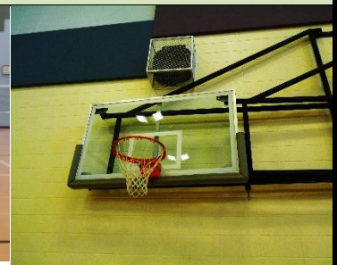
Gym from SW corner