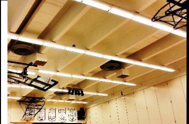
Gym from North wall