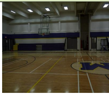
Taken from centre