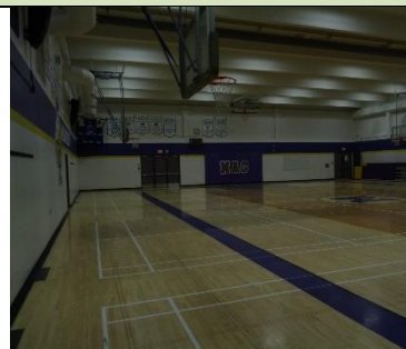
Taken from one corner