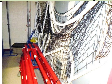
Correct storage of nets and poles