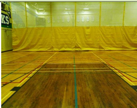
Taken from North Wall